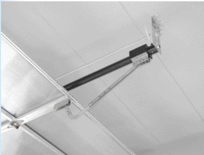
Close up of Overhead Trolley Style Operator with integrated internal cushioning that eliminates the need for external mechanical springs.

An operator designed for this environment should have a working piston that is totally enclosed from the environment. When the environment hinders the operator it needs to be enclosed. This is because, the chemicals that are so efficient at removing grease and contaminants from your customers' cars are hard on most door operators. Combined with the harsh wet environment mechanical items designed for standard conditions have difficulty functioning and shorter performance lives. The best solution is to separate the nasty conditions from the door operator. One solution is to use a totally enclosed magnetically coupled operator that is specifically designed for the car wash industry. Following are some other important performance items to look for.